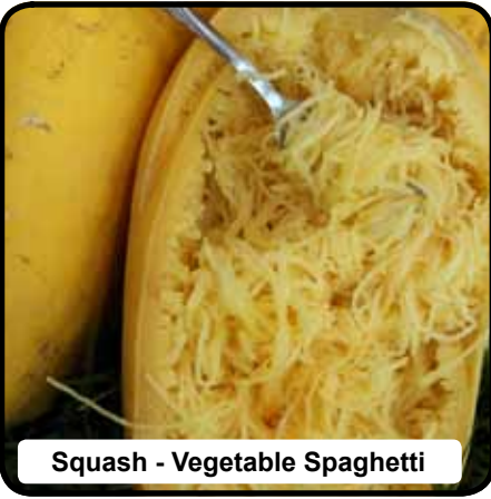
Squash - Vegetable Spaghetti