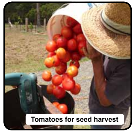
Tomatoes for seed harvest