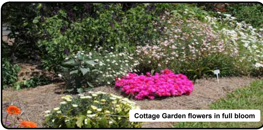
Cottage Garden flowers in full bloom