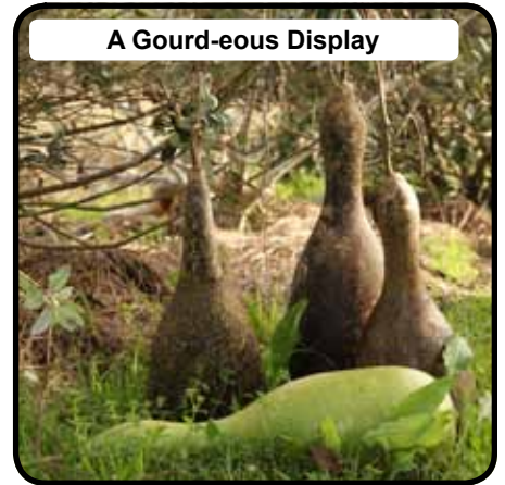
A Gourd-eous Display