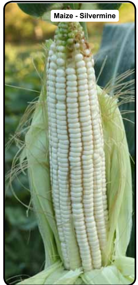
Maize - Silvermine