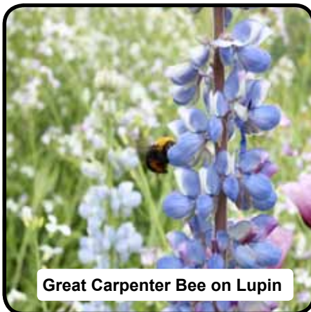
Great Carpenter Bee on Lupin

Every garden has an army of workers pollinating flowers everyday. Bees will come to your garden if they know there are flowers to forage on. Here are some plants to consider..