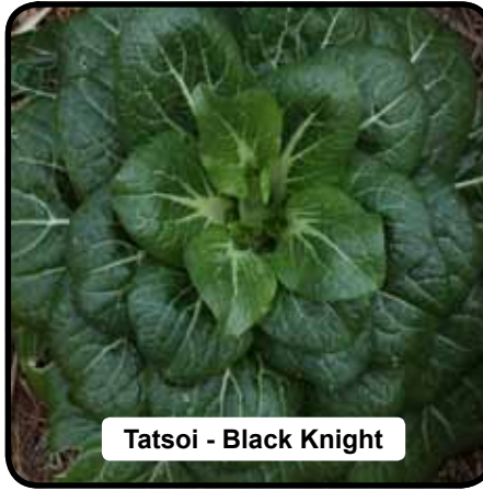
Tatsoi - Black Knight