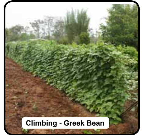
Climbing - Greek Bean