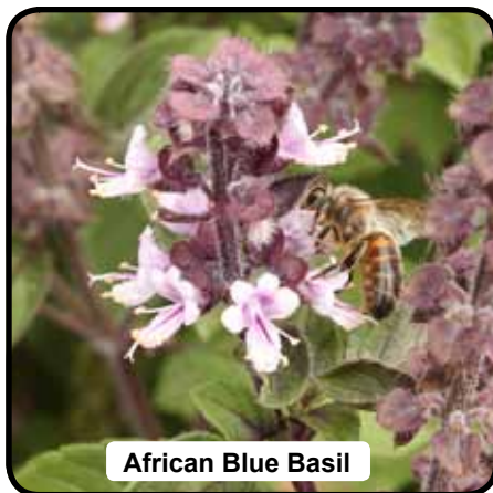
African Blue Basil