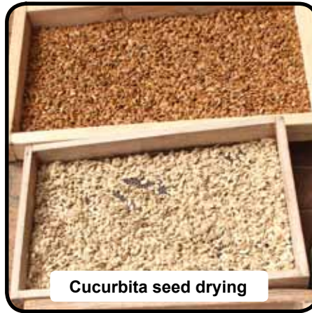
Cucurbita seed drying