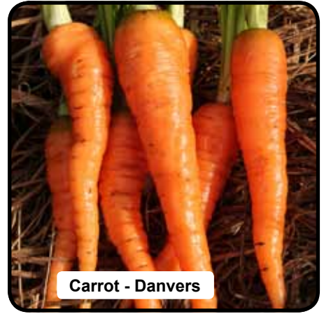
Carrot - Danvers