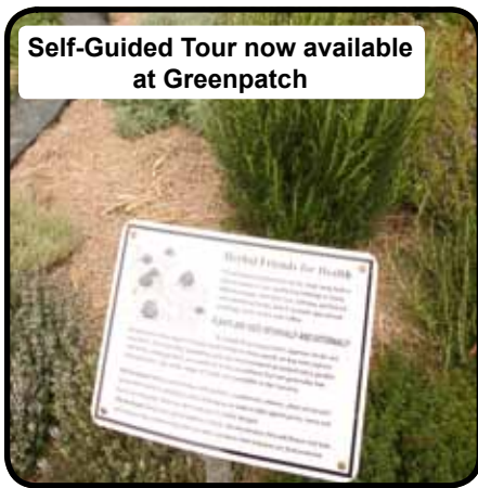
Self-Guided Tour now available at Greenpatch