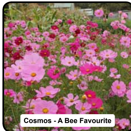
Cosmos - A Bee Favourite