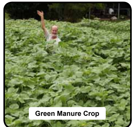
Green Manure Crop