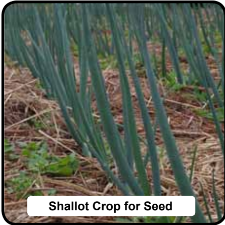
Shallot Crop for Seed