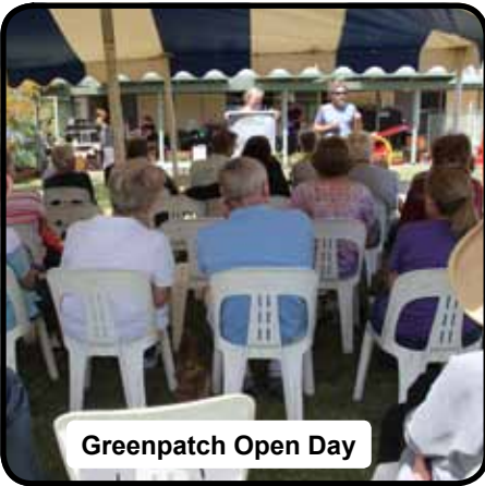
Greenpatch Open Day