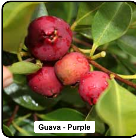
Guava - Purple