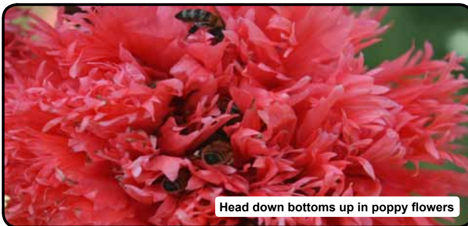
Head down bottoms up in poppy flowers