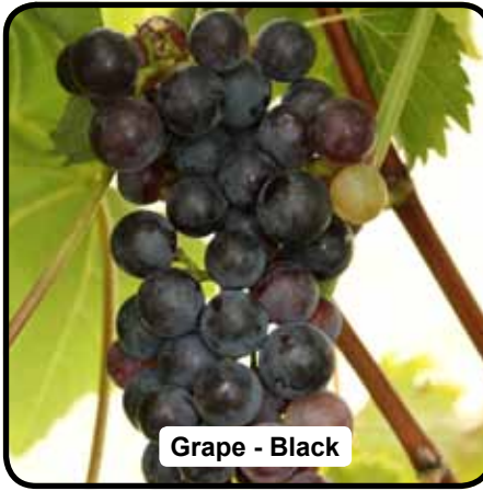
Grape - Black